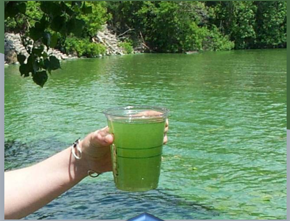
Fox River: Algae & Poor Water Clarity

The Village's stormwater drainage system is a network of grass swales, underground pipes and catch basins that carry stormwater pollutants directly to the Fox River, Garners Creek and Kankapot Creek without treatment. The drainage divides within the Village of Combined Locks are shown on the attached Watershed Map.